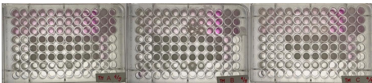
Fig. 2 – Antifungal activity of three Trichophyton mentagrophytes strains (TM A, TM B, TM C) using the microdilution method on 96-well microplates.

The results of the microdilution test of peppermint essential oil ( Mentha × piperita L.) with 3 replications against 3 strains of T. mentagrophytes (TM A, TM B, and TM C) confirmed that peppermint essential oil exhibited antifungal activity against all three fungal variants tested. The oil showed MIC values of 0.78% for TM A and TM B, and 12.5% for TM C (Table 2). This variation indicates differences in sensitivity among the fungal strains, possibly due to genetic or phenotypic differences.