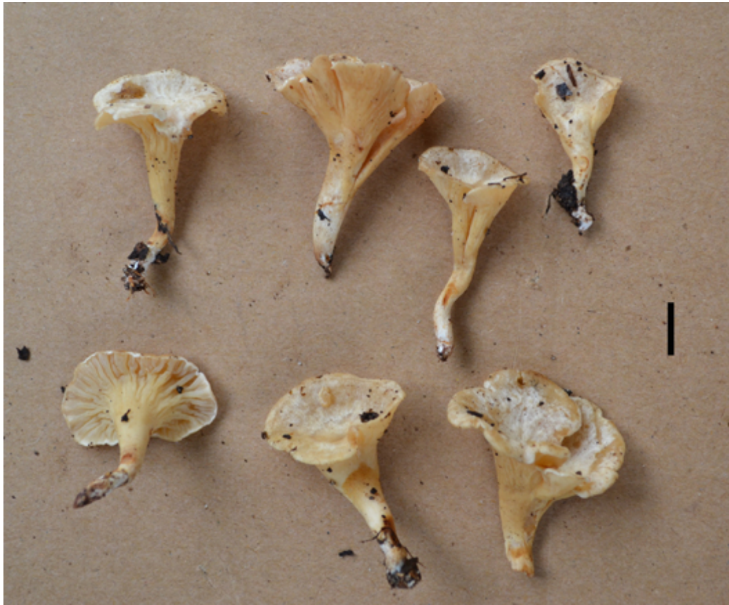
Fig. 1 – G. substramineus (Holotype). Basidiomes. – Bars = 10 mm.