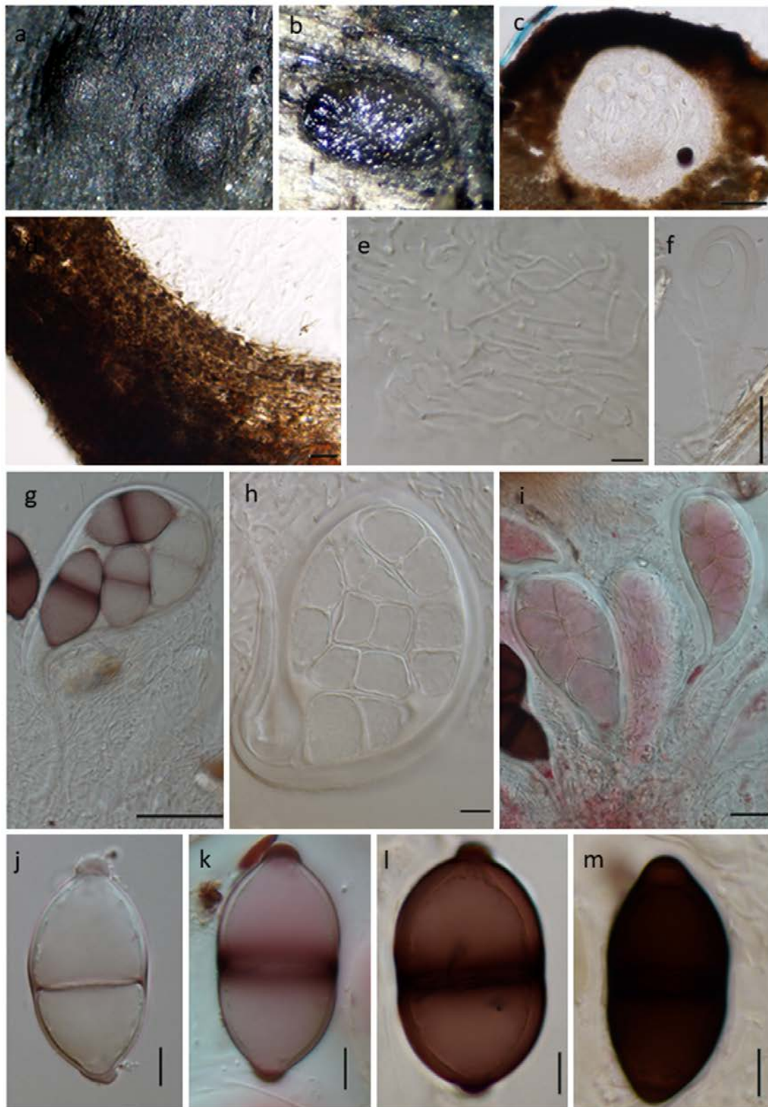
Fig. 1 – Pontoporeia mangrovei (AMH-9913, holotype). a Ascomata semi-immersed on the decaying wood of Suaeda monoica . b Horizontal section of ascoma. c Longitudinal section of ascoma. d Section of peridium. e Filiform, branched, septate pseudoparaphyses. f–i Immature and mature asci. j–m Ascospores. Scale bars: c = 100 \mu m, f,g = 50 \mu m, d,e,h-m = 10 \mu m.

walled, 6–7 transverse septate, mostly 6-septate, surrounded by a thin gelatinous sheath longer at the base when compared to apical part, with a single scythe like appendage at the terminal end.